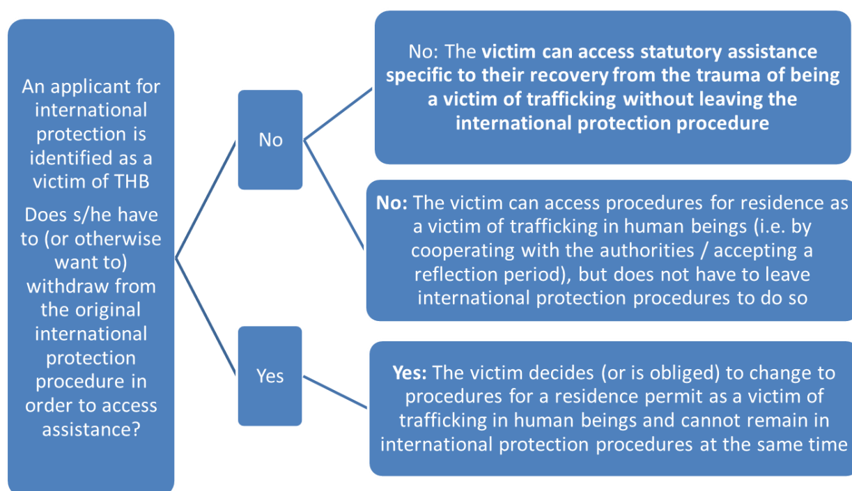
Figure 8.1: flow chart illustrating the possibilities for referral to assistance for victims in international protection procedures